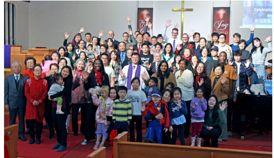
Fifth Sunday after the Epiphany